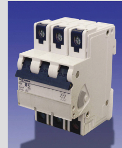
Branch Circuit Breaker 480V/20A